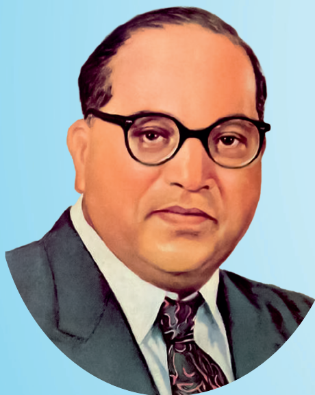
Dr. B R Ambedkar Great Economist