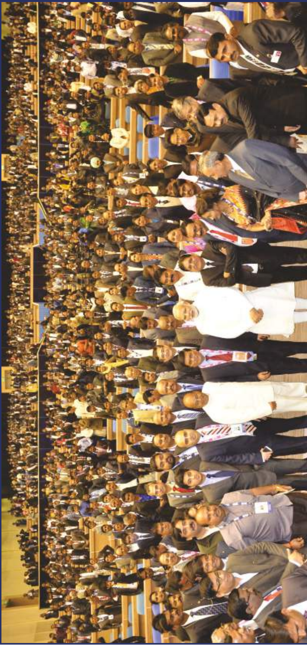
Shri. Narendra Modi, Hon'ble Prime Minister of India, Shri. Thawar Chand Gehlot, Hon'ble Minister of Social Justice & Empowerment, GOI, Padma Shri Dr. Milind Kamble with DICCI National Conference Delegates