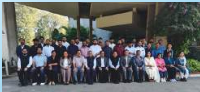
Institute of Rural Management Anand (IRMA)