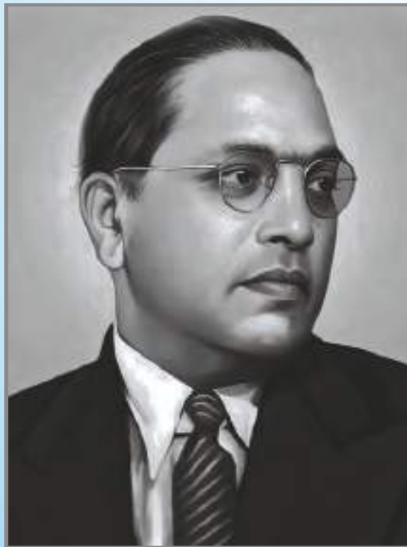
Bharat Ratan Dr. Babasaheb Ambedkar The Great Economist of India